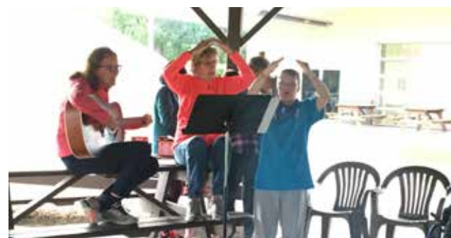
Chapel, worship, crafts, games, and more.