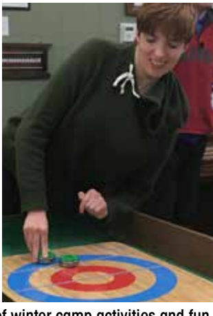
Lots of winter camp activities and fun.