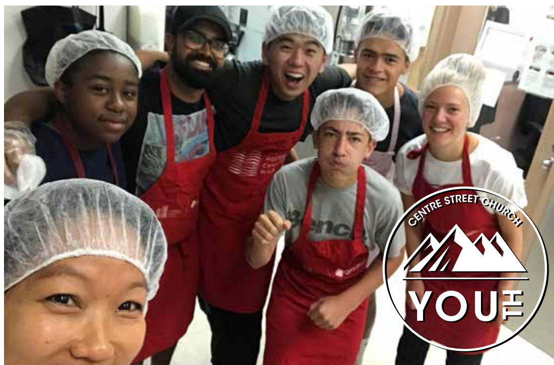
Youth from CSC served at the Drop-In Centre as part of the Calgary GMT week.

CSC News welcomes comments and feedback on all editions of this newspaper. Please email: communications@cschurch.ca