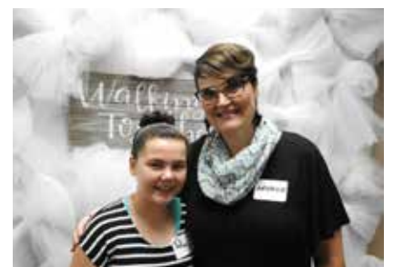
Mothers and daughters enjoyed a day together to share, learn and grow in their relationship with each other.